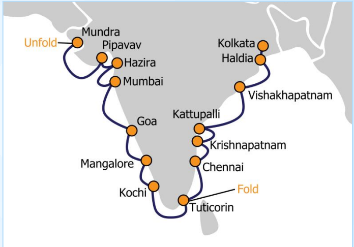
Transworld Group deploys 4FOLD on their intra-India routes

Transworld Group is recognized for their impeccable reputation for financial integrity, reliability and product delivery. The diversified activities of the group include: Ship Owning (Container & Bulk Carriers), Feeding, Ship Management, Shipping Agencies, NVOCC, Freight Solution, Logistics and Supply Chain Management.