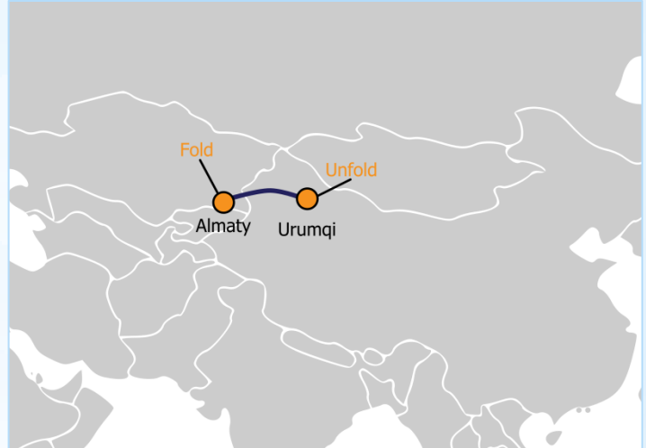
Sinotrans operates 4FOLD between Kazakhstan and China

Sinotrans helps its customers move their goods by rail from China to neighboring countries and Europe either in conventional wagons or in standard containers. Their long-standing partnership with rail transport authorities and forwarders in these countries enables them to provide their service efficiently, reliably and cost-effectively.