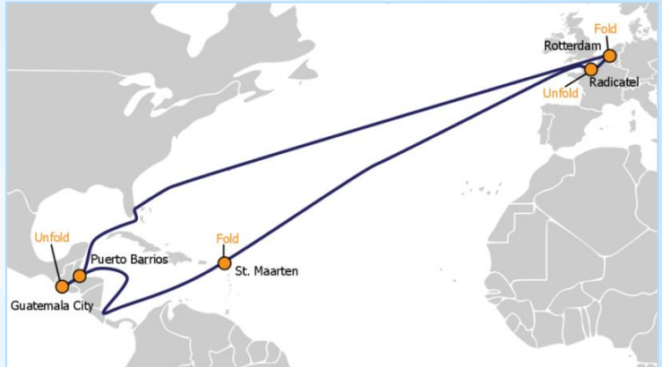
Seatrade deploys 4FOLD on their BlueStream service

Seatrade launched a new BLUE STREAM service in January 2016, connecting Europe with the Caribbean, Central America and Europe again.